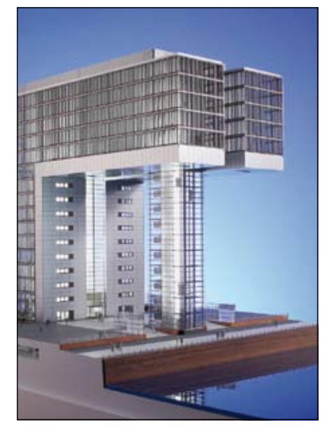
Kranhaus (Crane Building), Cologne scaled at 1:100; Architect: Bothe, Richter, Teherani, Hamburg; Materials: Plexiglas, polystyrene, wood (ground)