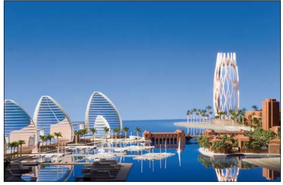
Holiday resort in Kisch (Iran) scaled at 1:1000 Architects: Rhode, Kellermann, Wawrowski, Duesseldorf Materials: Solid wood, plywood, Plexiglas, polystyrene