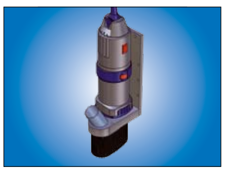
Suction device with Kress milling machine