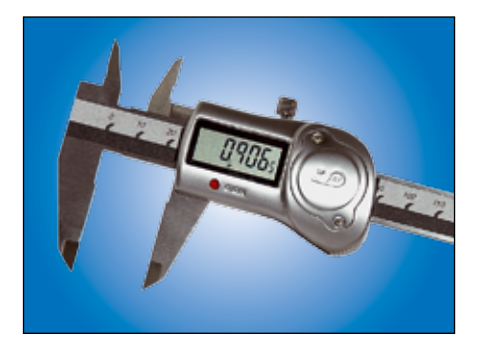
Step-Four's digital slide rule is waterproof.