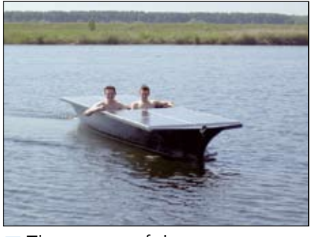
The power of the sun