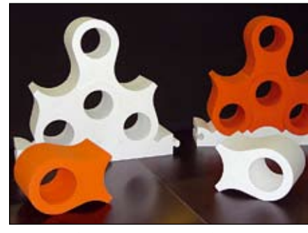
Matching room and screen systems