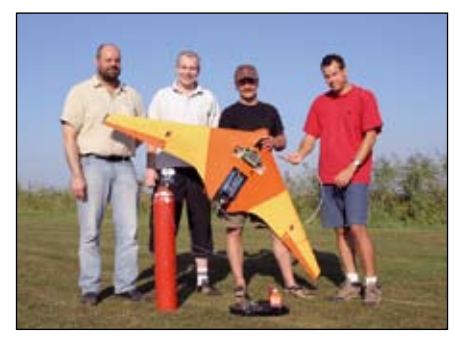
The creative designer team of the tailless wing.

HY-FLY – an unusual hybrid tailless wing containing a hydrogen/ fuel cell. In cooperation with members of the Rhine-Main model plane club students of the hydrogen laboratory at the university of applied sciences in Wiesbaden (Germany) developed a tailless wing with a wingspan of 2m weighing 2.55