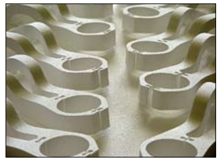
Cast aluminium molds made of polystyrene