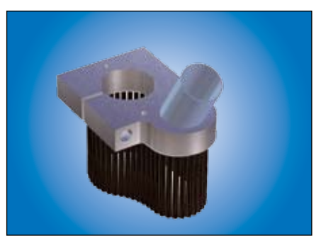
The new suction device