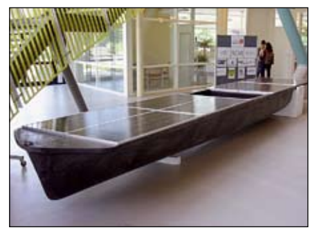
Solar-powered boat for interuniversity race