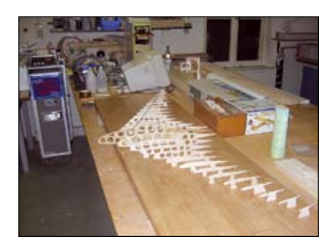
The wooden corpus of the tailless wing.

HY-FLY – an unusual hybrid tailless wing containing a hydrogen/ fuel cell. In cooperation with members of the Rhine-Main model plane club students of the hydrogen laboratory at the university of applied sciences in Wiesbaden (Germany) developed a tailless wing with a wingspan of 2m weighing 2.55