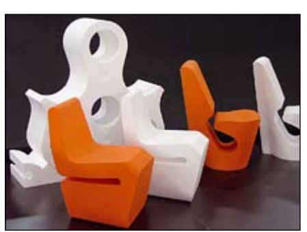
Designer furniture in the new Dutch embassy in Berlin

cutting. In the middle of this issue you can find a special pull-out article that introduces many more applications in this fascinating field.