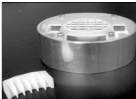
■ JetPump for model ships

Reto Mayer from Switzerland has come up with a remarkable miniature copy of the JetPump ship's engine manufactured by the company Schottel. "Without a 3D module it would not have been possible to produce optimum water flow channels", Mr Meyer writes. The tiny component is only 2 cm wide and is milled as a 3 D flow channel. For further information go to http://www.schottel.de/english/p_pump_jet/index2.htm