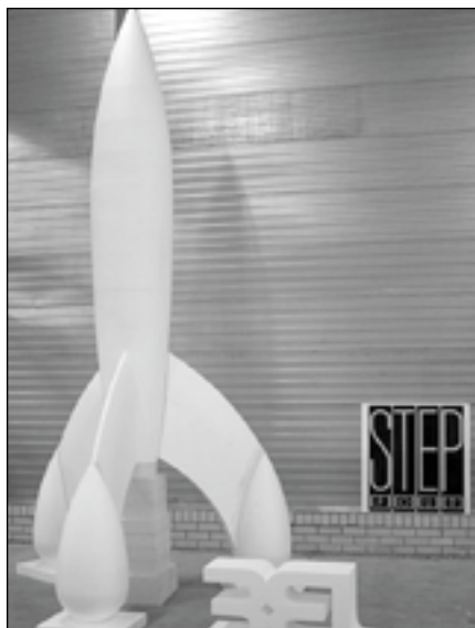
■ The rocket from the Tintin comic "Destination Moon"

Here you can see the latest creation of our cutting expert, Cock van Driel from Holland: the rocket from the Belgian Tintin comic "Destination Moon". Fancy a space flight?